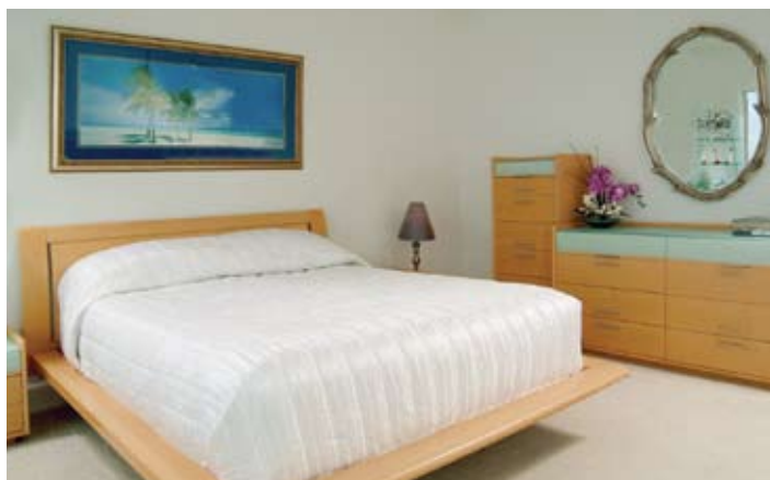
Above top and above: "As you lay in bed at night, you feel like you're on a ship," says Cynthia. "You don't feel like you're on land." Right: The powder room on the first floor is designed using the same gentle curves that flow into the adjacent family room.