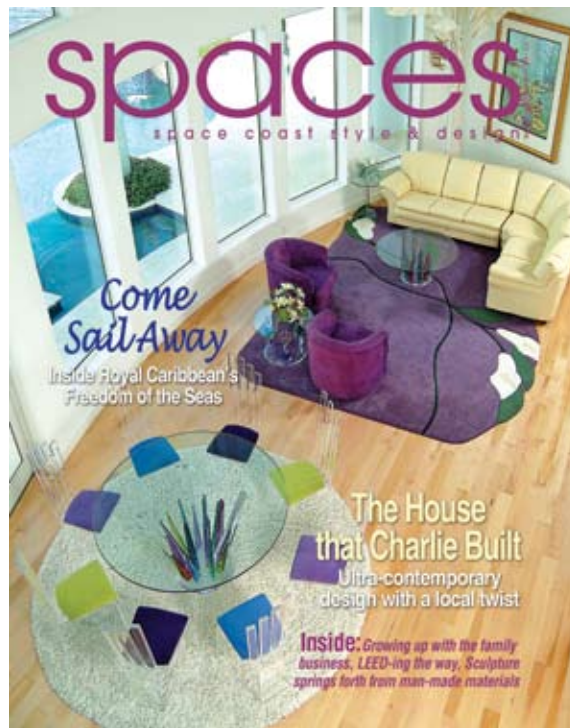
From the cover, a view from the top of the stairway overlooking the living room. The Cocoa Beach home's ultra-contemporary design is white and crisp like a sailor's dress uniform.

"It took almost as long to build the staircase as it did the whole house," laughs Boyd's wife, Cynthia.