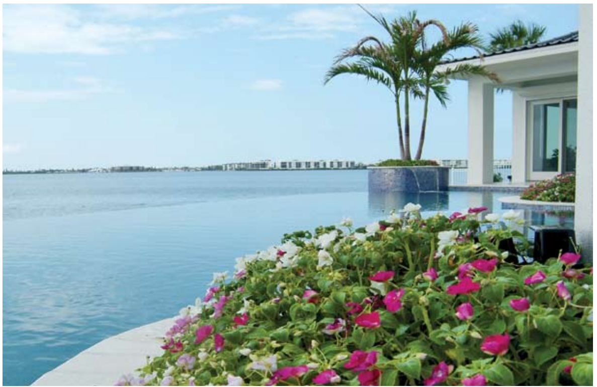
Above: And the view is indeed, glorious. Dolphins routinely cavort a few waves away from the Boyd's 50-foot infinity lap pool, while in the distance; cruise ships ply their way to sea.

includes large artwork niches to hold treasures such as two giant amethyst geodes the Boyd's picked up at the Dinosaur Store in Cocoa Beach. A custom sofa by Nancy Jones Wartell of Indian Harbour Beach flows along the curved wall.