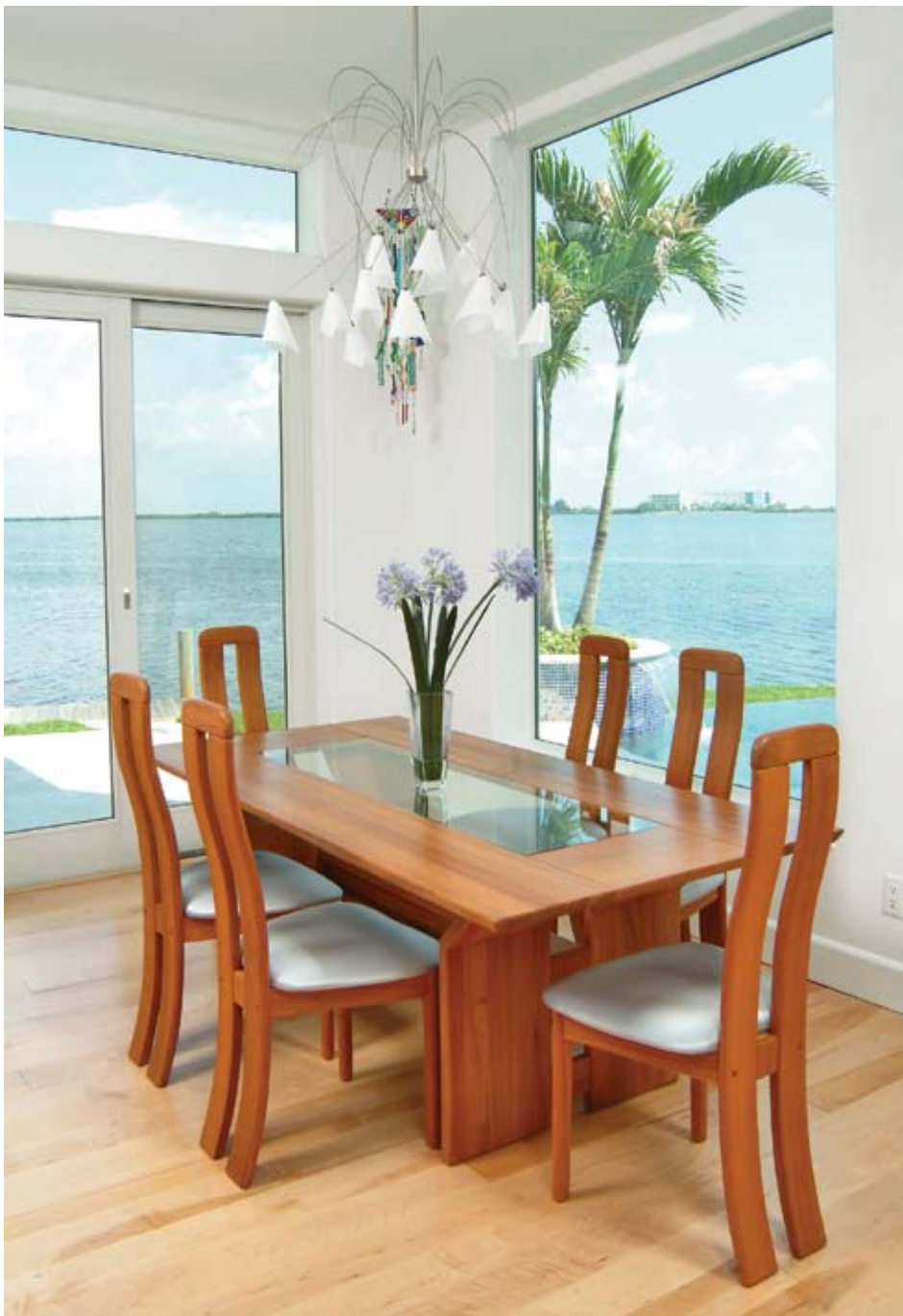
Above: "There is a water view in every room," says Boyd. "The whole house flows. You see curves everywhere to take advantage of the view."