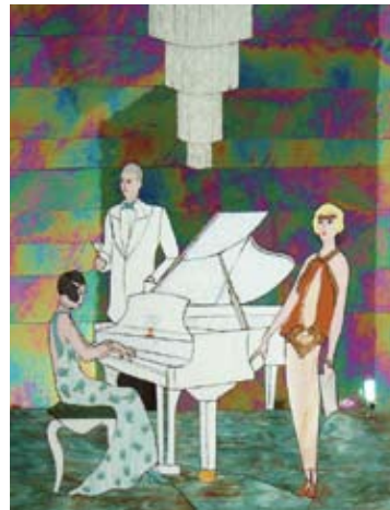
Far left: The giant crystal chandelier cascades down from the 22-foot-high ceiling. Left: The stained glass artwork the Boyds purchased at the Cocoa Beach art show mimics the chandelier and piano that it hangs next to. Above: The second floor game room provides more to-die-for views and access to a generous porch where guests can enjoy the sea breezes.

a dollop of whimsy for guests fortunate enough to stay in the Boyds' upstairs guest suite.