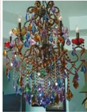
Above: A crystal chandelier, inset, makes a dramatic statement over the dining room table. Far right: The Kellys' daughter can return home from breaks at college to a bright and spacious second-floor bedroom with an oceanfront deck.