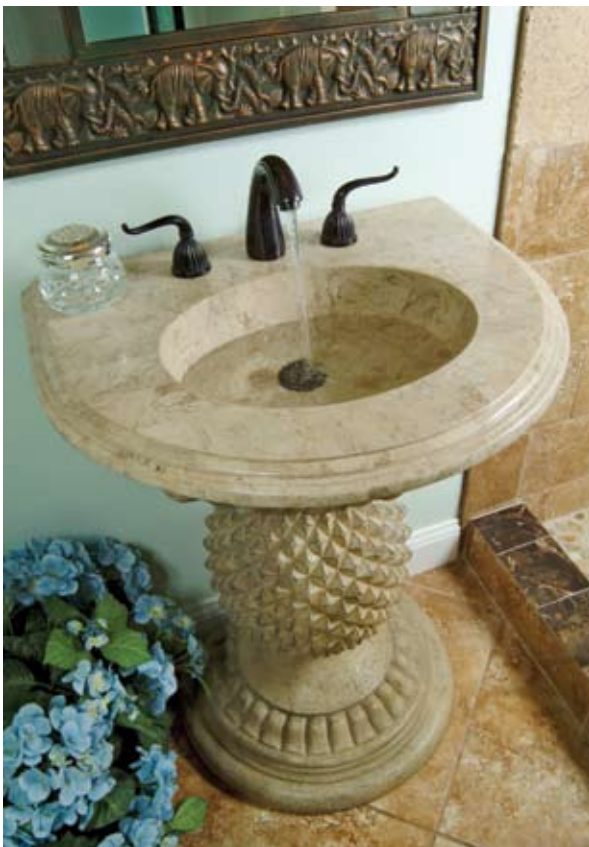
Above: A pineapple sink adds a tropical touch to the master bathroom. Right: Surfboards and other decorative touches accentuate the beach motif in the boys' bedroom.