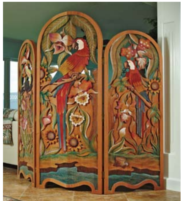
Above: A carved wooden screen with a colorful parrot continues the tropical theme of the home beside the living room. Left: Although much of the home's interior was renovated, the couple kept the original oak hardwood floors on the second floor, including the master bedroom.

She also completed the tile backsplash in the kitchen. Tyler laid slate on the second-story side deck. Slate also covers the main balcony off the second-floor bedrooms. "We're out here every day," she said.