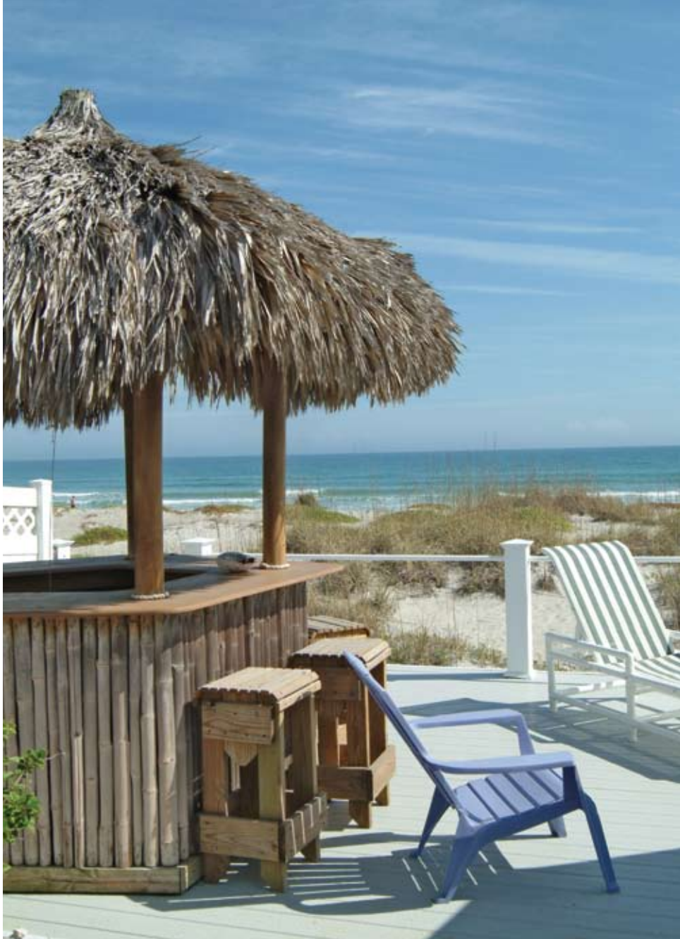
Above: A tiki hut in the home's backyard provides a perfect view of the dunes and surf.

to check out a listing he'd found, she didn't expect it to come to anything. She was wrong. "I just walked in and knew, 'This is it,'" she remembered.